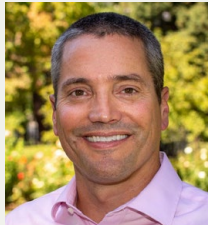
Wade Crowfoot California's Natural Resources Secretary