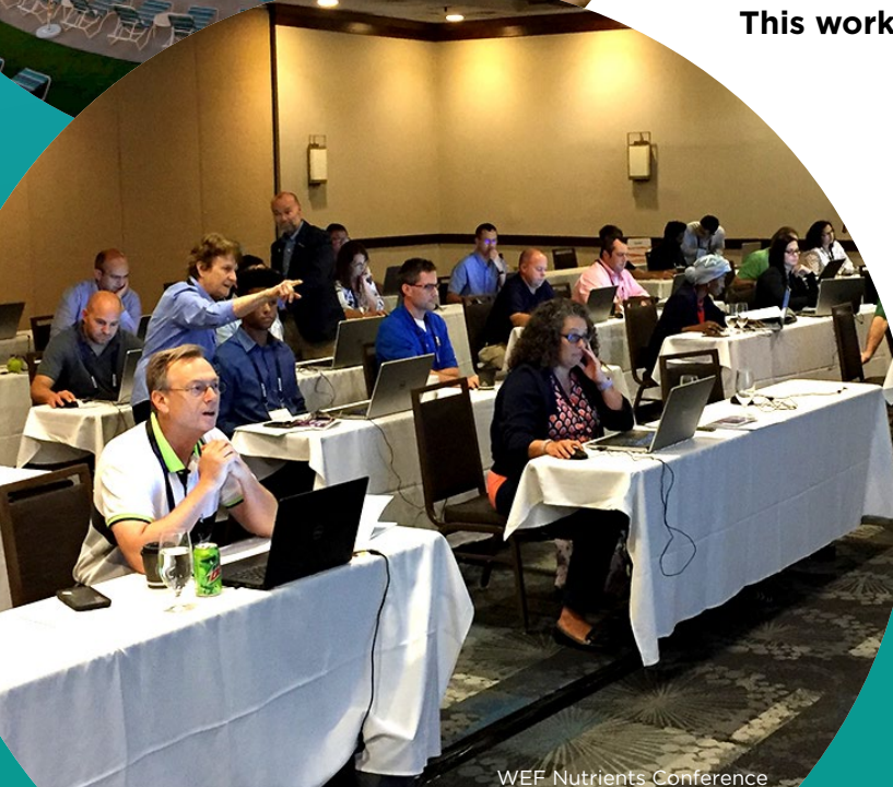
WEF Nutrients Conference