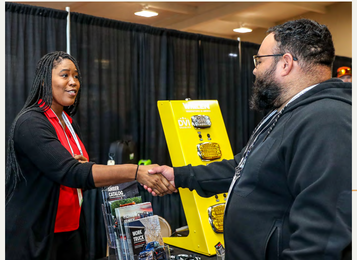
CWEA brings together wastewater professionals.