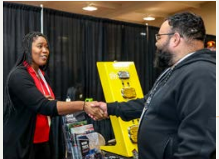
CWEA brings together wastewater professionals.